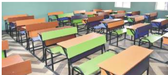
New classroom desks

health care and education, and the children will surely get quality education and brighter future with this educational facilities”