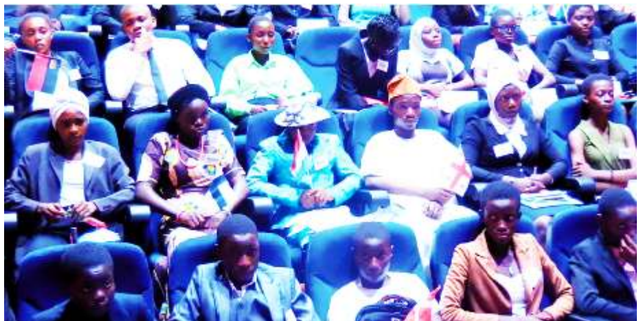
Cross section of Students Education District III participated as delegates to the 1st LASS-MUNN during climate change day