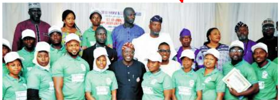
Cross section of participants during an ICT Empowerment Training.

He's convinced that 'if Nigeria must catch up with the rest of the globe in technological advancement, we must