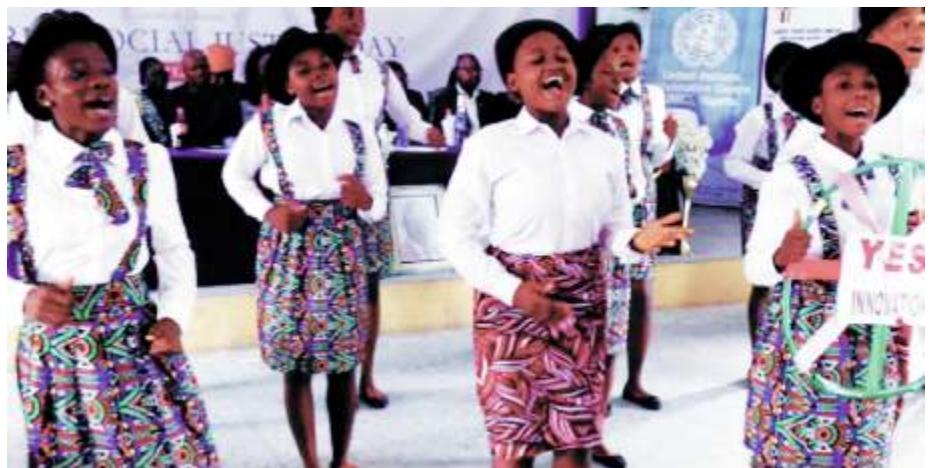
Students from Lagos State Senior Model College, Kankon performing during the World Social Justice Day Celebration in Education District V.

The United Nations believes that the pursuit of social justice for all will help promote development and human dignity.