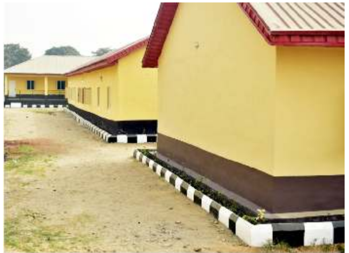
Newly built classroom and school hall

the facilities were commissioned. Mr. Governor also commissioned 3 blocks of fully furnished classrooms, 24 modern toilets, a hall and a recreation arena. Students trooped out of their classes chanting praises to the governor's name, raising white flags with Lagos State logo and also honoured him with cultural display.